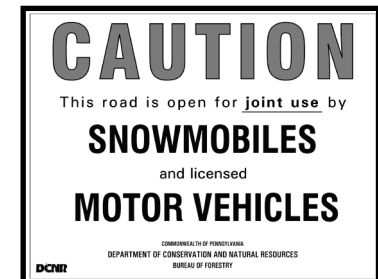
State Forest Roads

State forest and state park roads that are designated as joint-use roads are posted with a CAUTION sign like the sample shown below. Persons from age 10 through 15 may ride on these designated state forest and state park roads only if they hold a valid safety-training certificate issued or approved by DCNR and are under the direct supervision of a person 18 years of age or older.